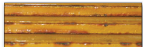
Traditional Powder Coating Systems

With Valspar Valde ECP, heavy machinery stays corrosion-free longer. Without it, rust can appear in less than 12 months.